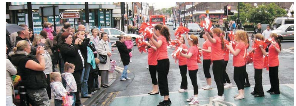
Children from Western Primary show off their dancing skills...