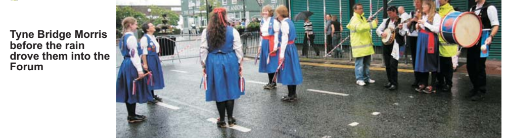
Tyne Bridge Morris before the rain drove them into the Forum