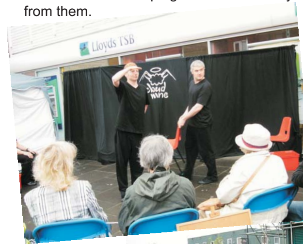
Cloud Nine performing 'Better the devil you know'

excellent.' He also commented in feedback that although the one day residency was very successful he felt it would have liked some sort of semi-permanent piece or stretching the project over more than one visit would be good for the users of the building. This is something rednile are really interested in developing for future Factory Night events and commissions from them.